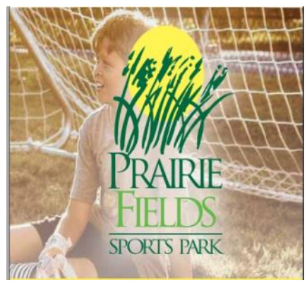
1111 Fairgrounds Road, Belvidere, IL 61008

The Prairie Fields Sports Park houses four full-size and one U10 soccer fields, one Junior football field (no goal posts), one baseball and one softball field to rent for your team or organization. There are also two practice soccer fields that are available to the public. Field reservations can be made at the Rivers Edge Recreation Center located at 1151 W. Locust Street Belvidere, IL. Fields are reserved on a first come-first paid basis. Depending on weather conditions, fields will typically be available to rent until mid-November. For more information, call (815) 547-9557. Or reserve at belviderepark.org