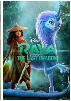
August 8 Raya and the Last Dragon