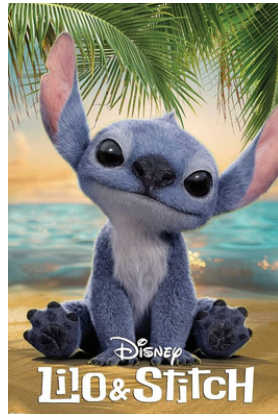
June 5 Lilo & Stitch

These events are free to the public! Bring your own chair or blanket and get ready to watch movies in the park under the stars! Join us starting at 7:45 PM at the Baltic Mill Stage. The movie will start at dusk!