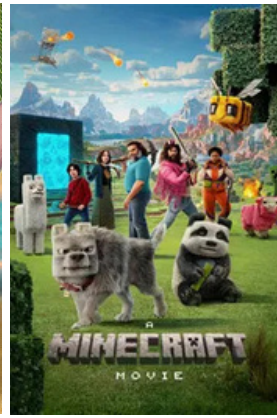
July 17 A Minecraft Movie